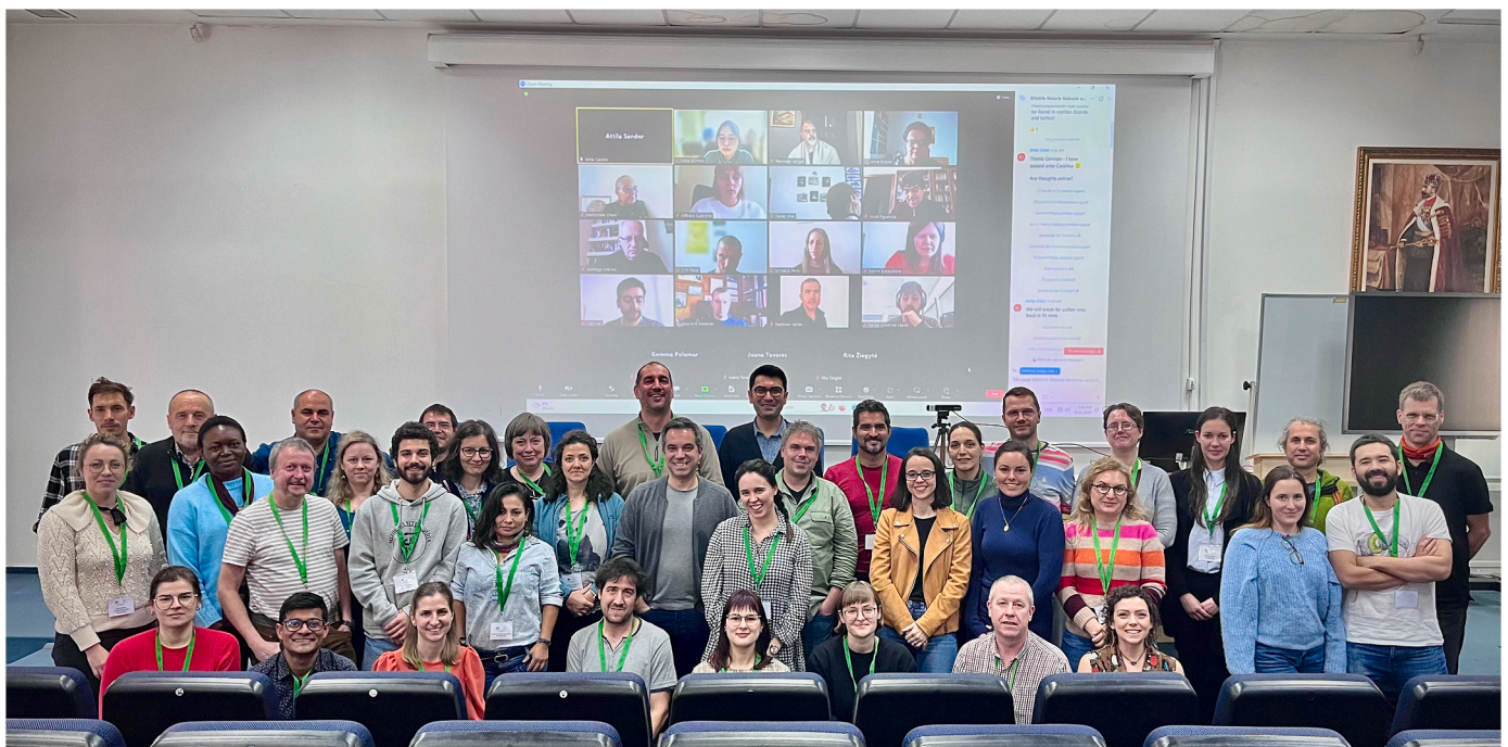
Fig. 1. A total of 84 people participated at the 1 st hybrid WIMANET workshop, celebrated at the University of Agricultural Sciences and Veterinary Medicine, Cluj-Napoca, Romania from February 20th to 23rd, 2024.

WG3 investigates factors influencing the transmission of wildlife malaria parasites by insect vectors. The group initially proposes to write review papers on wildlife malaria vectors, categorized by vertebrate groups (birds, reptiles, amphibians, and mammals). They also plan to establish standardized protocols for wildlife malaria research. A significant goal is to develop a network interaction map of vectors and their parasites, requiring data from various countries. WG3 encourages members to share sampling and processing protocols for the study of the interactions between wildlife malaria parasites, vertebrate hosts and insect vectors.